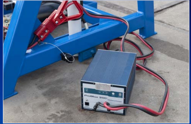
Optional battery charger